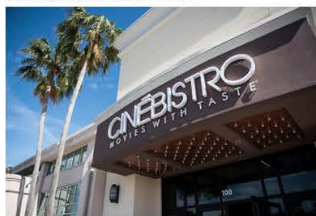
CineBistro at Westfield Southgate is on S. Tamiami Trail in Sarasota.