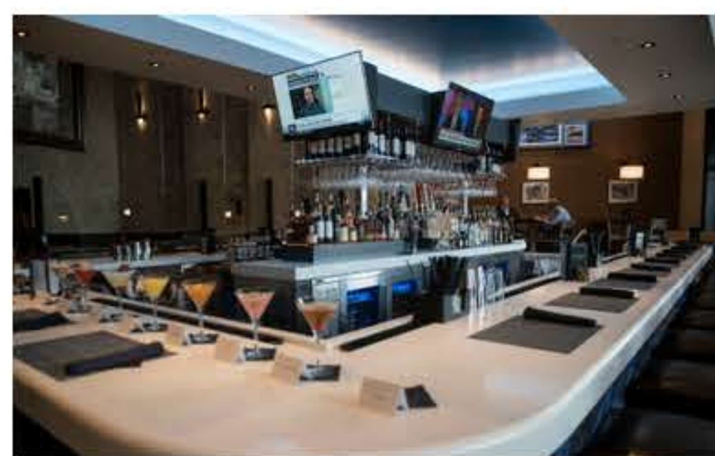
Enjoy the bar at CineBistro even if you're not seeing a movie.

The CineBistro experience expands beyond the seven dark auditoriums filled with flickering images and booming sound, though. People are encouraged to hang out at the handsome, spacious bar under the high ceiling and chic stone walls even if they have no intention of seeing a film. Same goes for having a meal at the adjacent 150-seat restaurant, which welcomes all ages. There's outdoor dining (facing the parking lot), too, and a lounge area for drinking and snacking while observing the mall walkway by the entrance to Macy's.