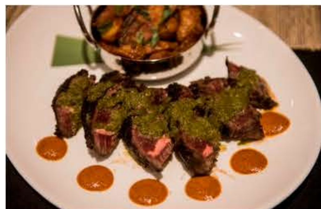
The Hanger Steak ($22) at CineBistro.

As for the entrées, filmgoers will have their choice of steaks, lamb, seafood — cod, scallops, salmon — and a pasta dish. I enjoyed the filet and lamb I tried more than the salmon, but I also sampled the pan-seared salmon last, which meant it sat in that cold theater the longest. The seared scallops, served in a cauliflower puree, were impressive, too. The entrees range in price from $15 (spaghetti) to $32 (lamb).