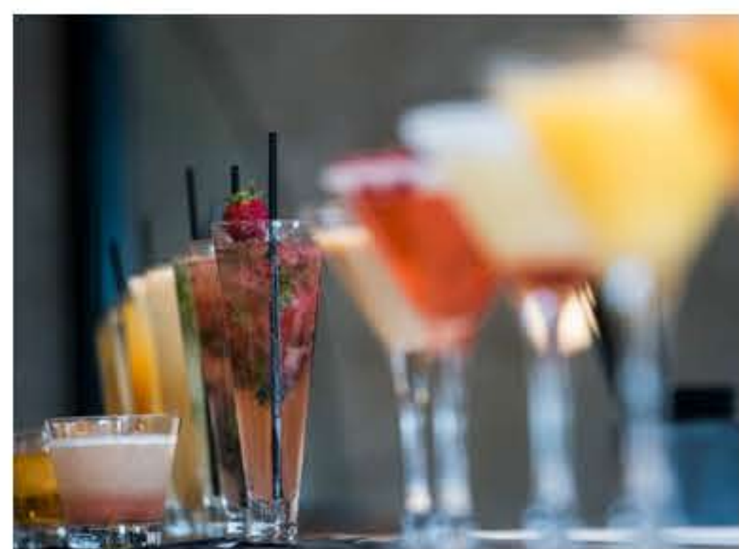
A display of the craft cocktails at CineBistro.

Speaking of treats, if you've got an old school sweet tooth, CineBistro does serve candy classics like Raisinets, Reese's Pieces and Twizzlers. Traditionalists will also take comfort in knowing the cinema still serves popcorn, with complimentary refills for $8. All your favorite Coca-Cola products are available as well.